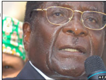
Robert Mugabe, Zimbabwe's president, wants another term in office

Tension has been high in the country since police broke up a prayer meeting in March organised by the main opposition party, detaining and beating several government rivals, including opposition leader Morgan Tsvangirai, of the Movement for Democratic Change (MDC).